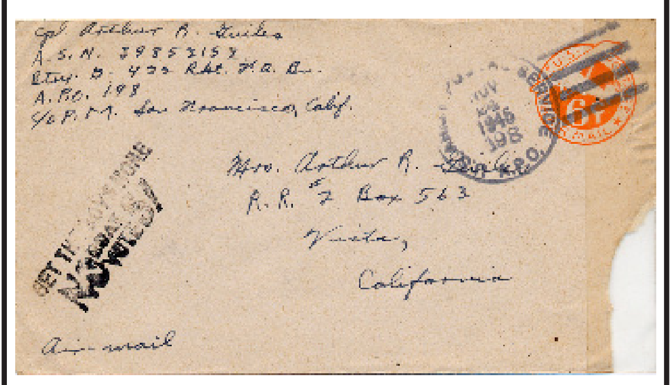
GI-69, November 24, 1945 - APO No.198 - San Marcelino (Zambales), Luzon

Note: These slogans, however, were not slogan cancels, but plain postal slogans, used at different APOs. All illustrations are in their original sizes.